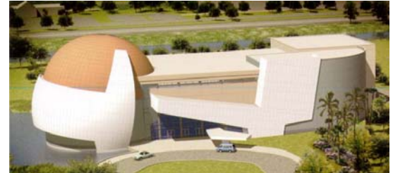
Entrance to Dekelbom Science Center