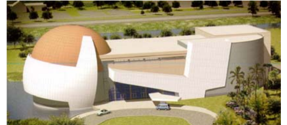
Entrance to Dekelbom Science Center

Community Partnerships - The Elsie & Marvin Dekelbom Family Foundation has formed partnerships with a number of community stakeholders to create a state-of-the-art science center that will greatly expand the region's economic, educational, and cultural resources.